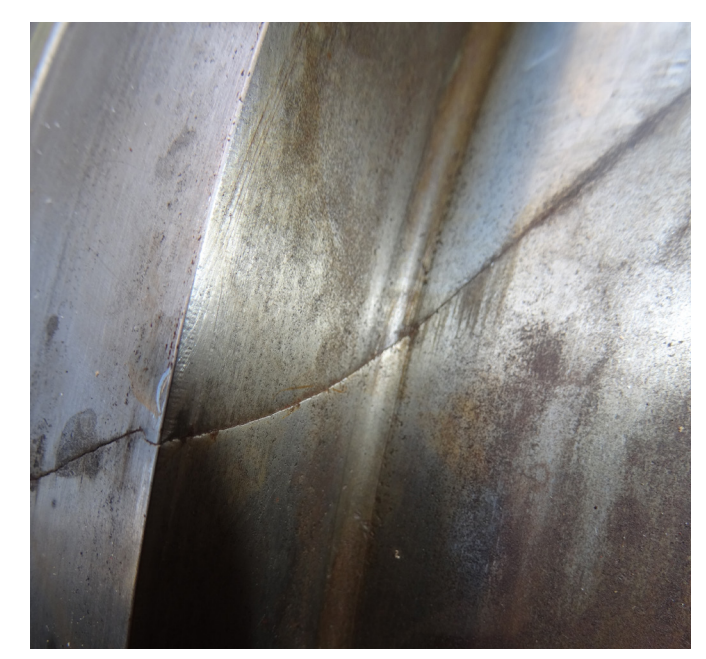
Excessive amplitudes of torsional vibrations can lead to shaft cracking without warning.

Integrate with your DCS — TORSO Detect can be installed on most encountered types of machines and be integrated easily with your DCS or monitoring system.