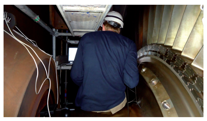
Our method makes it possible to carry out the inspection without dismantling of the rotor.